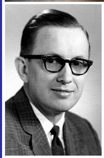
Celebrating 40 Years of Volunteer Eye Care to the Underserved

VOSH/INTERNATIONAL Volunteer Optometric Services to Humanity