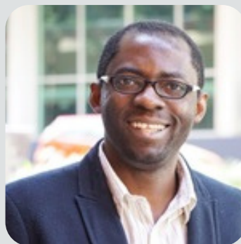
Supporting Students' professional development The African Federation of Optometry Students (AFOS)