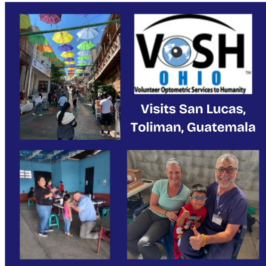
Visits San Lucas, Toliman, Guatemala