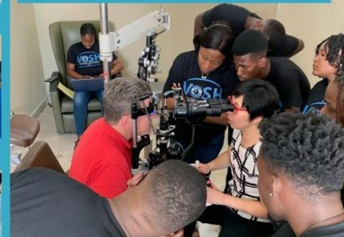
Second Teaching Clinic for the 5th-year Haitian optometry students