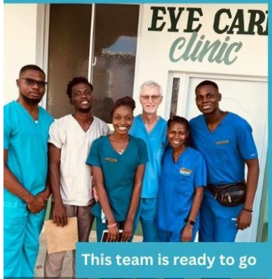
This team is ready to go