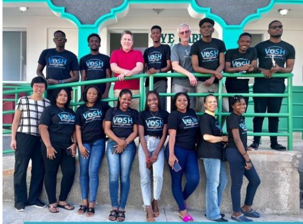
Arrival to the New Hope Hospital, Cap Haïtien, Haiti