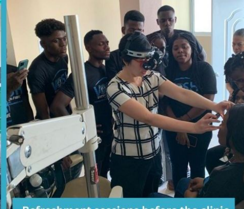
Refreshment sessions before the clinic