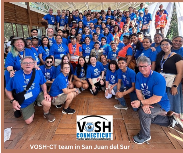
VOSH-CT team in San Juan del Sur