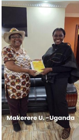
Makerere U. -Uganda