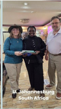
U. Johannesburg South Africa