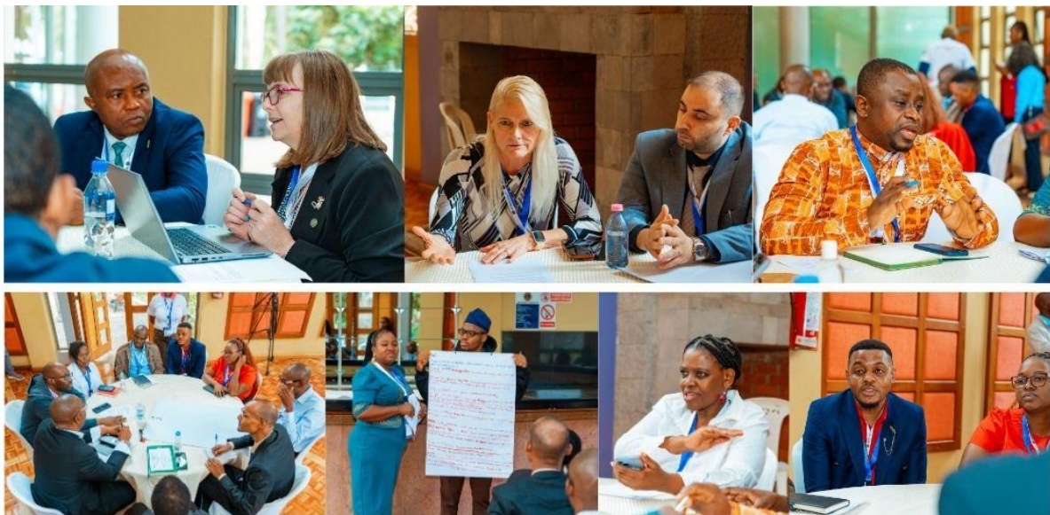
Engaged group discussions.

The discussions and exchanges that followed enriched the working group deliberations. The working groups, including one dedicated to partners, were tasked with developing actionable suggestions based on their discussions. This process helped identify shared challenges and practical recommendations related to measuring clinical learning, the role of academic institutions in promoting optometry’s recognition and regulation, quality assurance in optometry programmes, and technologies suitable for low-resource settings. Partners also contributed specific suggestions on strengthening optometric education, promoting evidence of optometry’s impact, and connecting these efforts with global processes and directives.