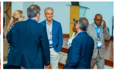
Upon arrival at the Lions SightFirst Eye Hospital, delegates adhered to a clinical protocol and proceeded to register.