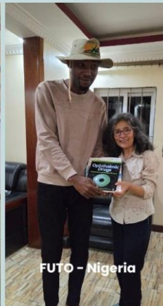
FUTO - Nigeria