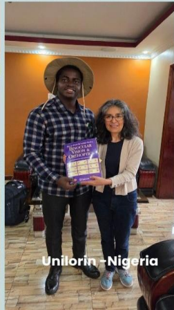
Unilorin - Nigeria