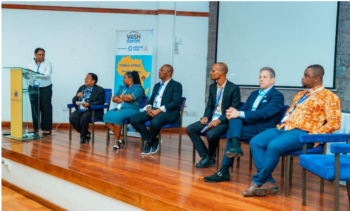
Day 1 concluded with a highly engaging panel discussion that included representatives from Uganda, Nigeria, Ethiopia, Malawi, Ghana, and the United States.