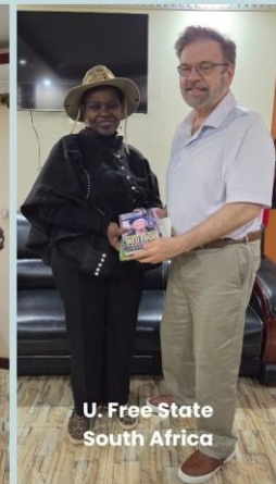
U. Free State South Africa