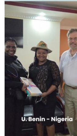
U. Benin - Nigeria