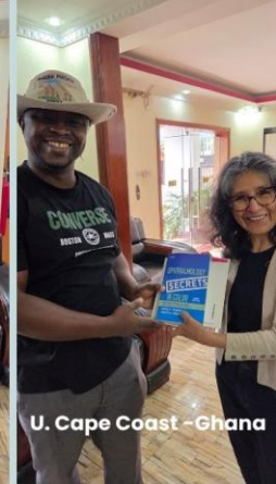
U. Cape Coast - Ghana